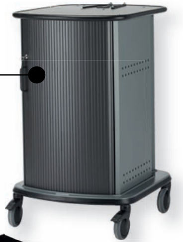
equipment trolley with control unit air supply